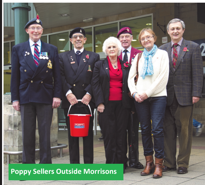
Poppy Sellers Outside Morrisons

Remembrance Sunday, held on the second Sunday in November, is the day on which we remember all those who have given their lives in wars and conflict. On this day, people across the country pause to reflect on the servicemen and women who have lost their lives. The National Service of Remembrance is held at the Cenotaph in Whitehall, where Prime Ministers and the Queen attend; however local services are also held in each village, town and city at the same time. On Remembrance Day in Meltham, there is a parade from Carlile Street to St Bartholomew's Church, led by the Meltham Mills Band and the local British Legion Branch. Town Council members march in procession and attend the church service that follows. There is an open invitation for all members of the public to take part.