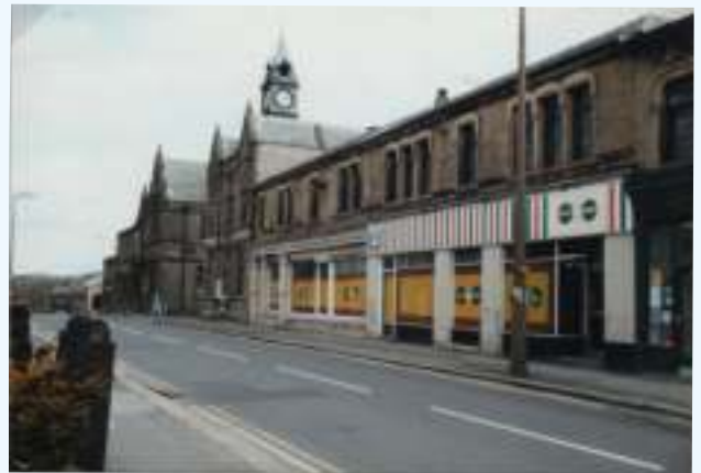
CO-OP & TOWN HALL 1990