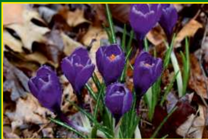
Bulbs in the formal garden area

The park is also haven for wildlife, as well as the ducks on the pond there are lots of grey squirrels, a scurry or dray is the name for a group; look out for them in the woodland to the left of the drive. In spring we often see the young and they are fearless!