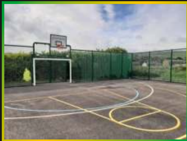
The new ball court at THE COMPLEX

Like many community-owned businesses, Meltham's Sports and Community Centre has faced very challenging times during the last two years covid pandemic. However, we are bouncing back, having started a wide range of improvements to the sports changing rooms and the bar/event space which includes new lighting, new CCTV, re-upholstery and redecoration. The most dramatic change is the construction of a new multi-use ball court providing space for 5-a-side football, basketball, netball and other activities. The latter is being funded from monies paid by Barratts' housing development. There is also a full package of improvements to Broadlands Rec, including a completely new play area, tree planting, outdoor gym and improvements to the existing pitches, which will follow on once the ball court is opened. The trustees of the centre have also agreed to rebrand the facility as 'The COMPLEX' as this has become the common name used by many over the last few years.