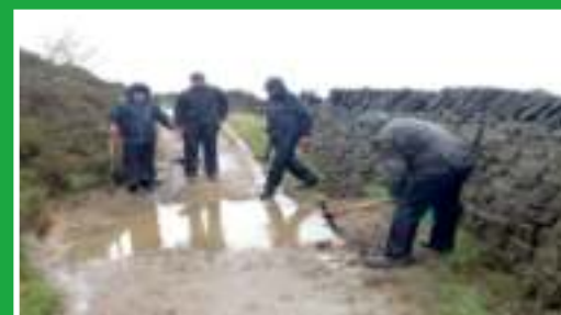
Volunteers from Kirklees Bridleways group clearing the drains on Meltham Cop

Join us if you share our aim of protecting and improving our Rights of Way network. www.kirklees.bridlewaysgroup.co.uk